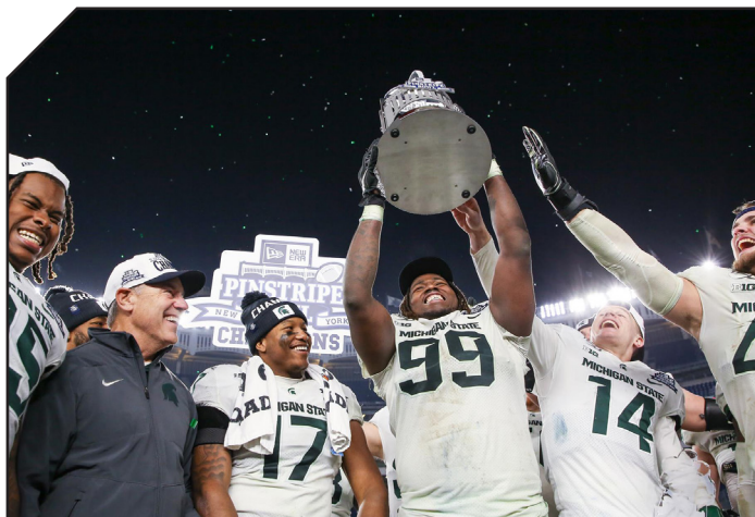
A special thank you to Farm Bureau for sponsoring our U Pick Em cards and to Spartan Sports Tours for sponsoring our Student of the Week program.